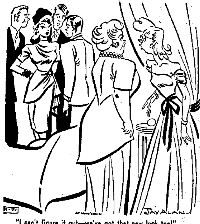
"I can't figure it out—we've got that new look too!"