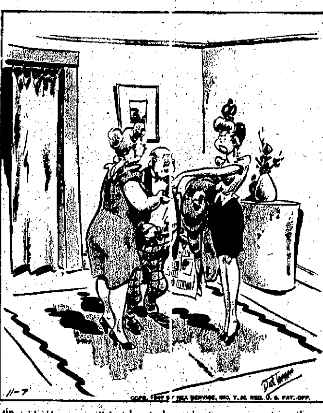
"But Herkimer says it just has to be a short engagement, mother—so he can get the ring back to the finance company!"

Q. What is the oldest incorporated company in the world? T. B. O. A. The distinction is claimed for the Copper Mining Company of Sweden. Its charter dates back to 1347.