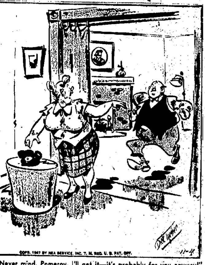
"Never mind, Pomeroy, I'll get it—it's probably for you anyway!"