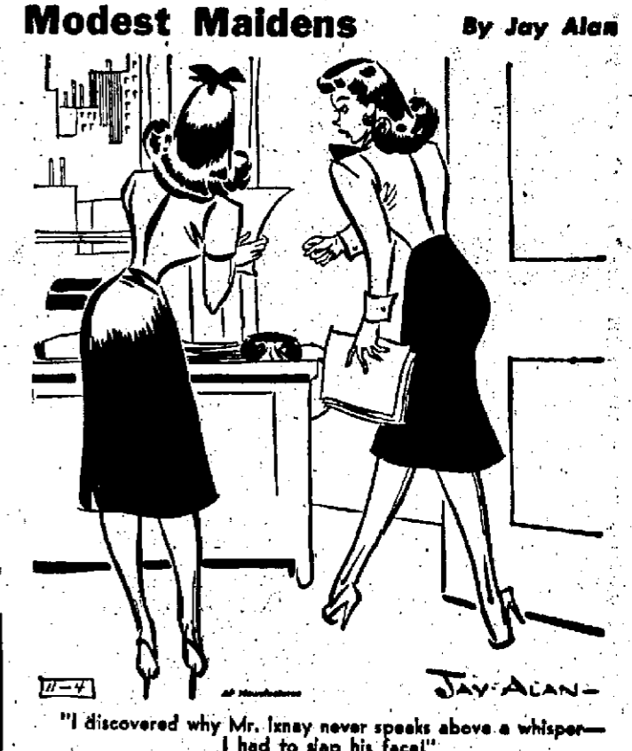
"I discovered why Mr. Inmy never speaks above a whisper—I had to slap his face!"