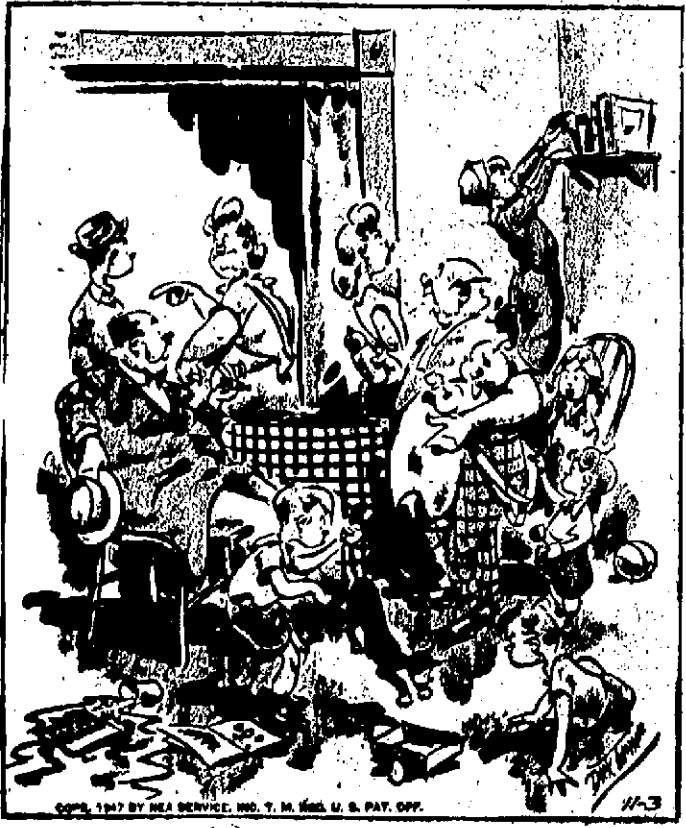
"Frankly, we're stuck for a name!"