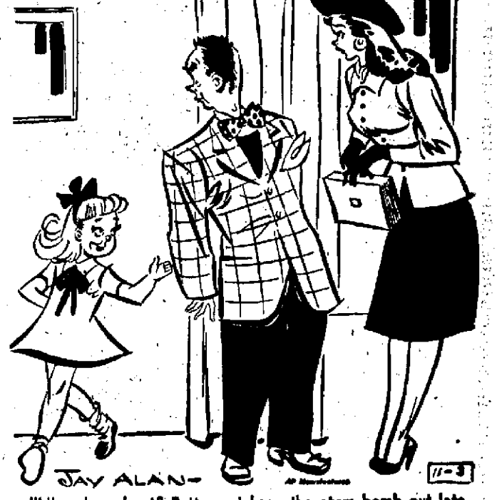
"H'ya dreamboat? Better not keep the atom bomb out late or you'll be sunk."