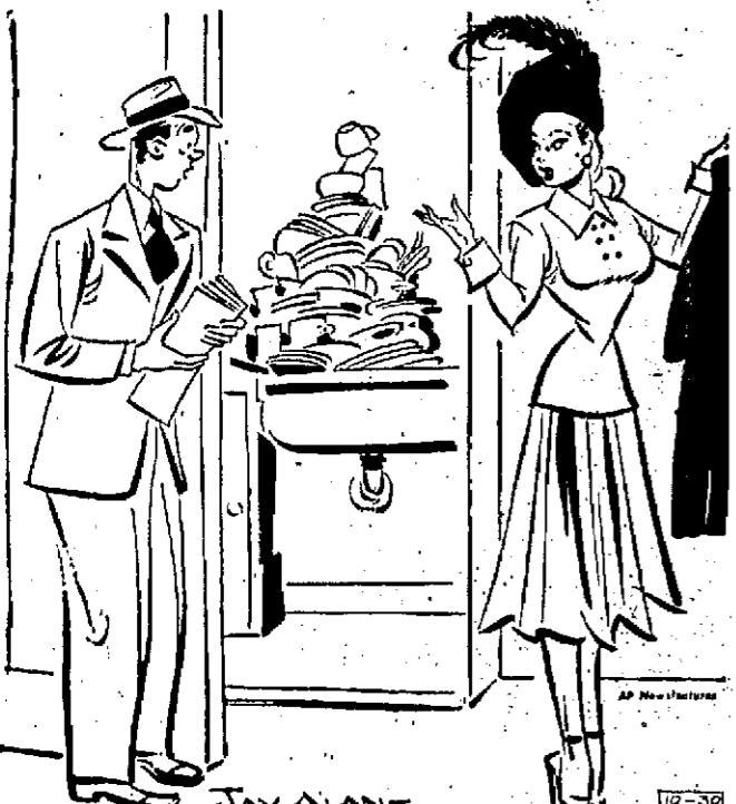
"Goodness! I guess we'll have to eat out again tonight—every dish in the house is still dirty!"