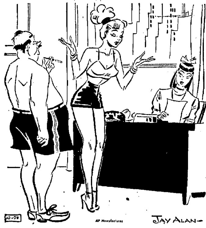
"Mr. Blup wants to maintain an informal atmosphere in the office."