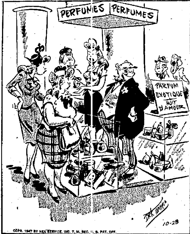
"Can't you say something besides 'just waft it back and forth like garlic?'"

spade and heart suit, you must bid the spade suit first unless you do have a powerful hand. If you have four spades to the ace-queen, and five hearts to the ace-king, you should open the bidding with one spade.