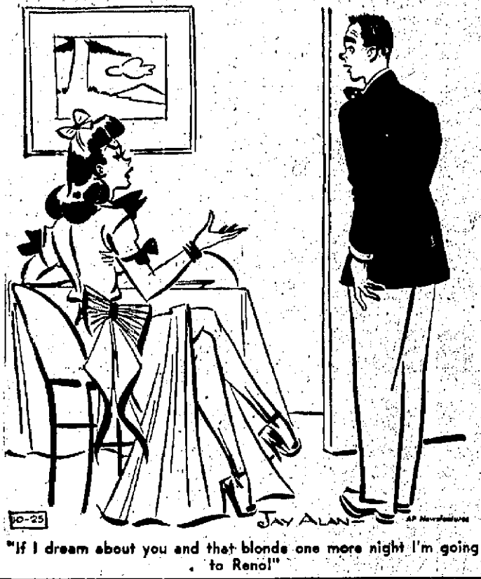
"If I dream about you and that blonde one more night I'm going to Reno!"