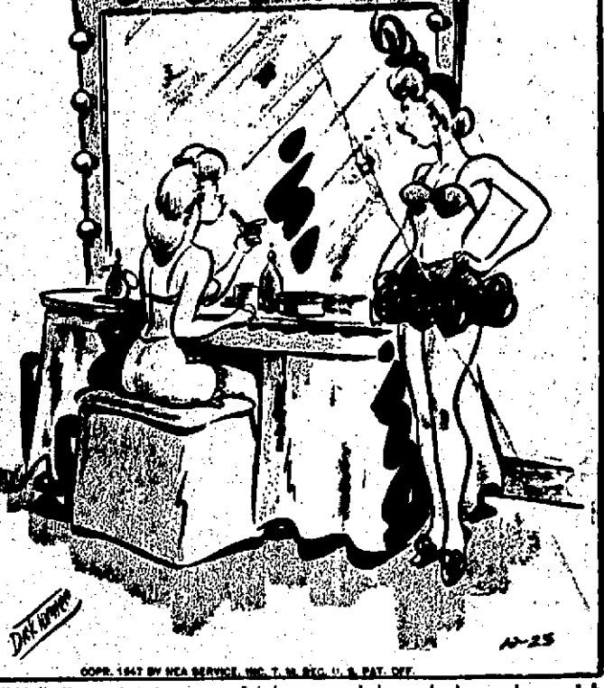
"Well, I'm going to marry for love—and, boy, do I ever love milk and limousines and pearls and things!"