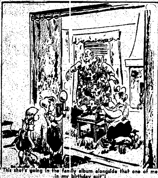
This shot's going in the family album alongside that one of me in my birthday suit!