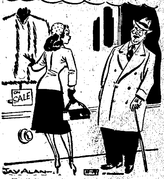
"But, darling, it's reduced from $3999 to only $3950!"