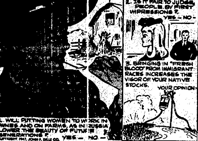
1. WILL PUTTING WOMEN TO WORK IN MINES AND ON FARMS, AS IN RUSSIA, LOWER THE BEAUTY OF FUTURE GENERATIONS? YES - NO