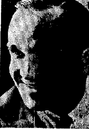
AL JOLSON WIBA at 5 p. m.

U.S.A. (WBBM): story of Jane Addams. 10:30 a. m. — Eternal Light (WMAQ): "The Trolley Bible." 4:30 p. m. — Greatest Story (WBBM): how a Roman army operated 2,000 years ago. 7 p. m. — Exploring the Unknown (WIBU): Lucille Ball as a worried mother. 8 p. m. — Theater Guild (WBBM): Paul Henreid, Geraldine Fitzgerald, Mildred Dunnock in "Lucie, Happy." 8:30 p. m. — The Right to Live (WIBA): with Dana Andrews, Katherine Hepburn.