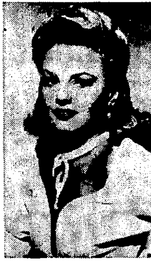
JANET BLAIR WGN, WIBU at 8 p. m.

8:30 p. m. — Hour of Charm (WBBM): "Prelude" and "Toreador Song" from "Carmen," Overture to "Barber of Seville," "Intermezzo" from "Cavalleria Rusticana," "One Fine Day" from "Madame Butterfly," "Intermezzo" from "Jewels of the Madonna," Strauss, "Vienna Life."