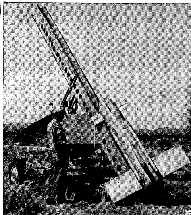
This is "Little Joe"—Lt. Comdr. inspects "Little Joe," a short-range, radio-controlled anti-aircraft developed late in the war against the Japanese. "Joe" is designed for launching from a shipboard catapult.

A hint of what such weapons might do is seen in the war-time