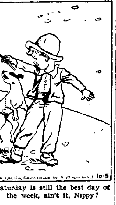
Saturday is still the best day of the week, ain't it, Nippy?