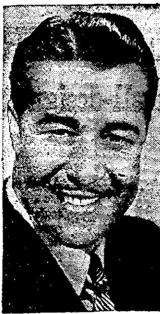
DON AMECHE WIBA at 8 p. m.

Today's Aces Special Broadcast 2 p. m. — Archbishop of Canterbury (WBBM): first radio address since arrival in United States, on "Brotherhood of Man," before convention of National Council of Protestant Episcopal church at Philadelphia.