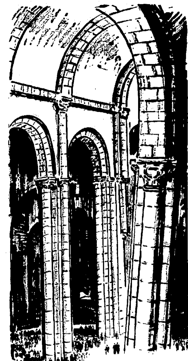
THE TOTTERING CHURCH of SANTA MARIA del SAR, Spain THE LEANING PILLARS AND BULGING WALLS WERE DELIBERATELY DESIGNED BY THE ARCHITECT—YET IT HAS STOOD FOR OVER 800 YEARS!