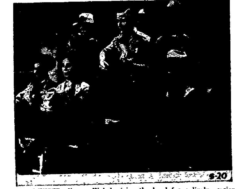
"TUNEFEST"—Jimmy Wakely joins the band for a lively session of cowboy music in the fast-paced musical outdoor hit, "West of the Alamo," due Saturday mid-night at the Lyric theatre. Wakely stars, with Lee "Lasses" White featured.