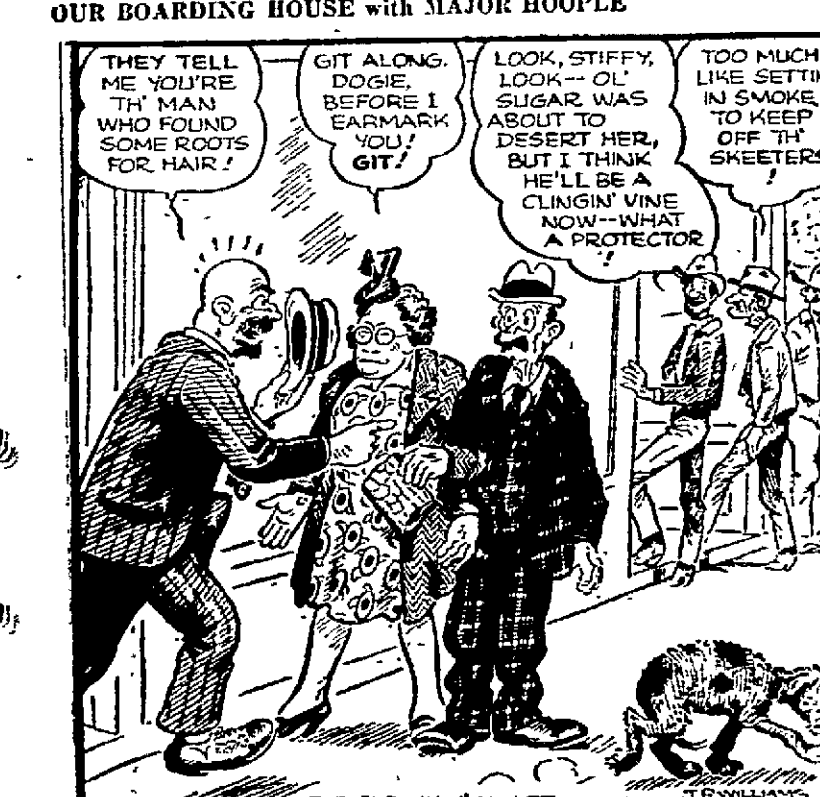
THE SHRINKING VIOLET