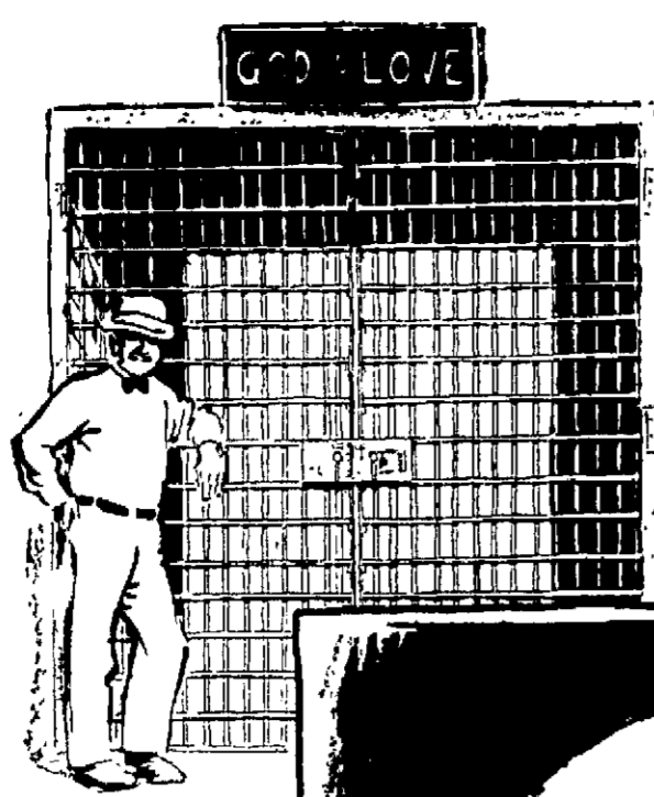
A SIGN OVER THE PRISON DOOR RAIFFORD, FLORIDA