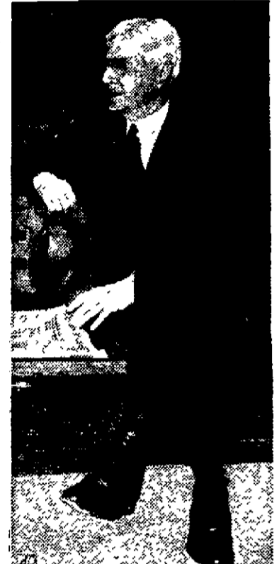
Bernard M. Baruch