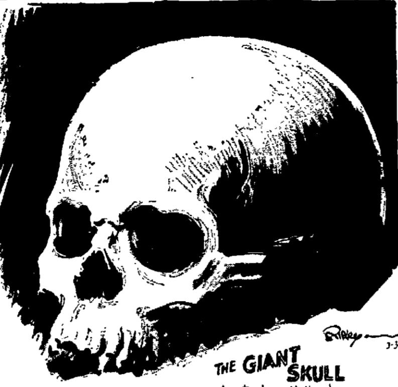
THE GIANT SKULL Amsterdam, Holland 12 INCHES WIDE AT THE TEMPLES 20 INCHES FROM CHIN TO CROWN