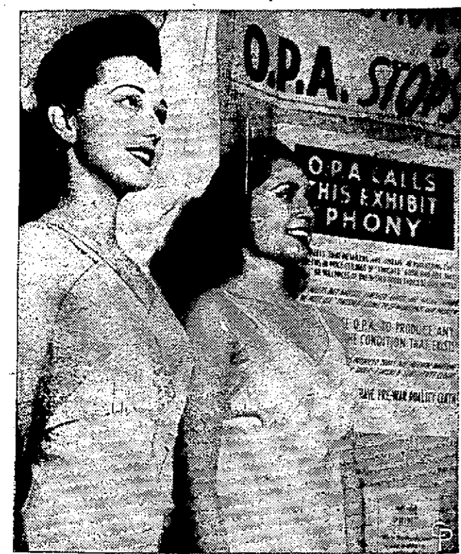
Using living models, plus an exhibit of charts and goods, the National Dry Goods Assn. has set up a display in the house office building in Washington to prove to congressmen that Office of Price Administration (OPA) pricing procedure is unfair to established manufacturers.