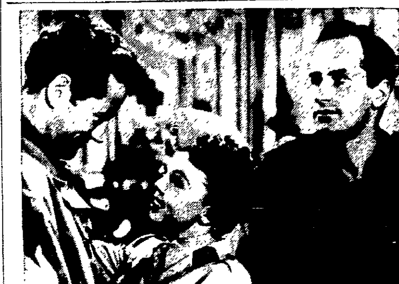
"LAUGH TRIO"—Keenan Wynn is an interested spectator to the romantic moment between Robert Walker and Jean Porter, in "What Next, Corporal Hargrove," opening Saturday at the State theatre.