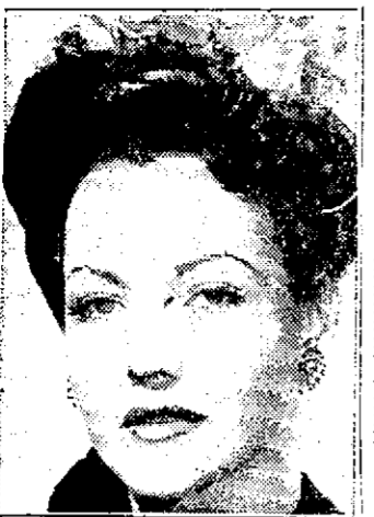
LYNN BARI WBBM at 1:30

Religion 8 a. m. — Youth Looks Up (WGN): from St. Mary's church school, Park Ridge, Ill.; music, "Ave Maria," "When Morning Glids the Skies," "Fair Lord Jesus."