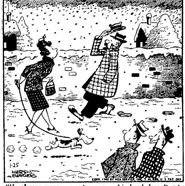
"He always wears an extra one so his head doesn't get cold when he tips his hat!"