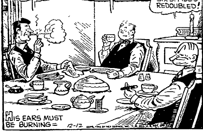
THIS EARS MUST BE BURNING =

OUR BOARDING HOUSE with MAJOR HOOPLE. THE MAJOR HAD ANSWERED MESS CALL FOR THREE DAYS—I CAN'T HELP MISSING THE MAN—IT'S SOMETHING LIKE THE FEELING AFTER THEY REMOVE THE CAST FROM YOUR LEG!