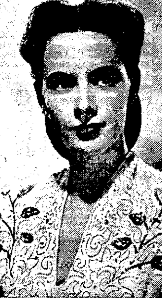
SUSAN PETERS WBBN at 7:30