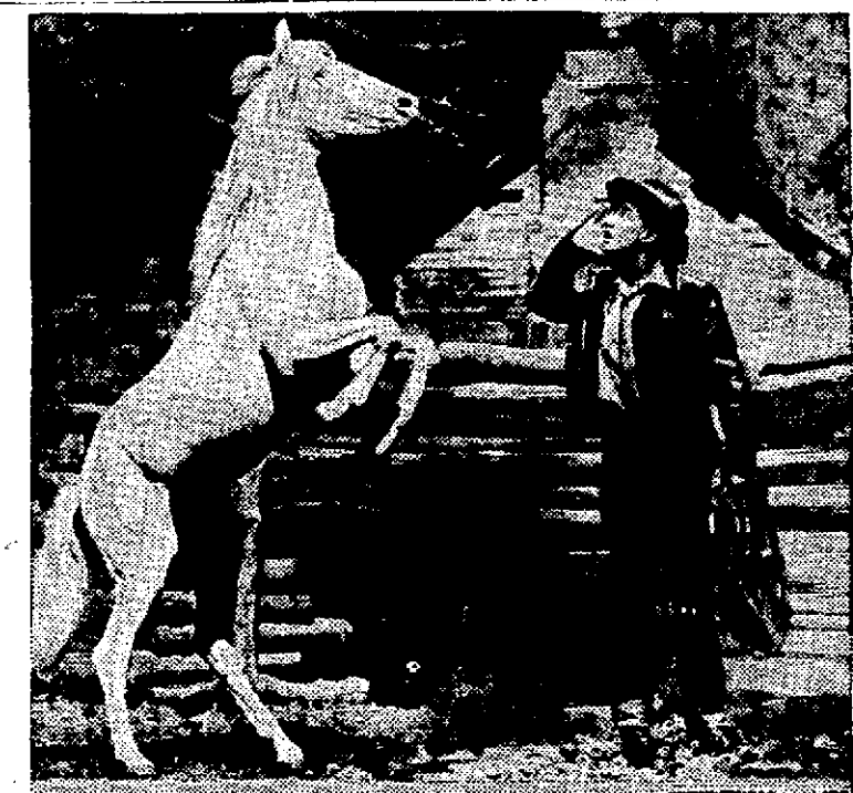
"ALBINO"—Blazing with the excitement of life, the depth of love, and the urge to adventure that is the West, "Thunderhead—Son of Flicka" comes to the screen of the Lyric theatre on Monday with Roddy McDowall heading a brilliant cast including Preston Foster and Rita Johnson. The picture, based on Mary O'Hara's best-loved best-seller, was filmed in brilliant Technicolor.