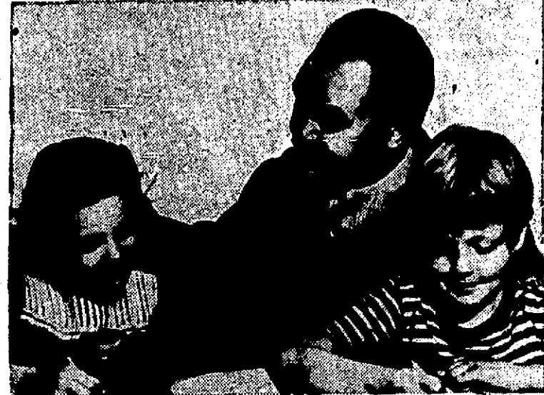
OPENS AT STATE—Edward G. Robinson runs thru their school lessons with Margaret O'Brien and Jackie Jenkins in this scene from "Our Vines Have Tender Grapes" opening Thursday at the State theatre.