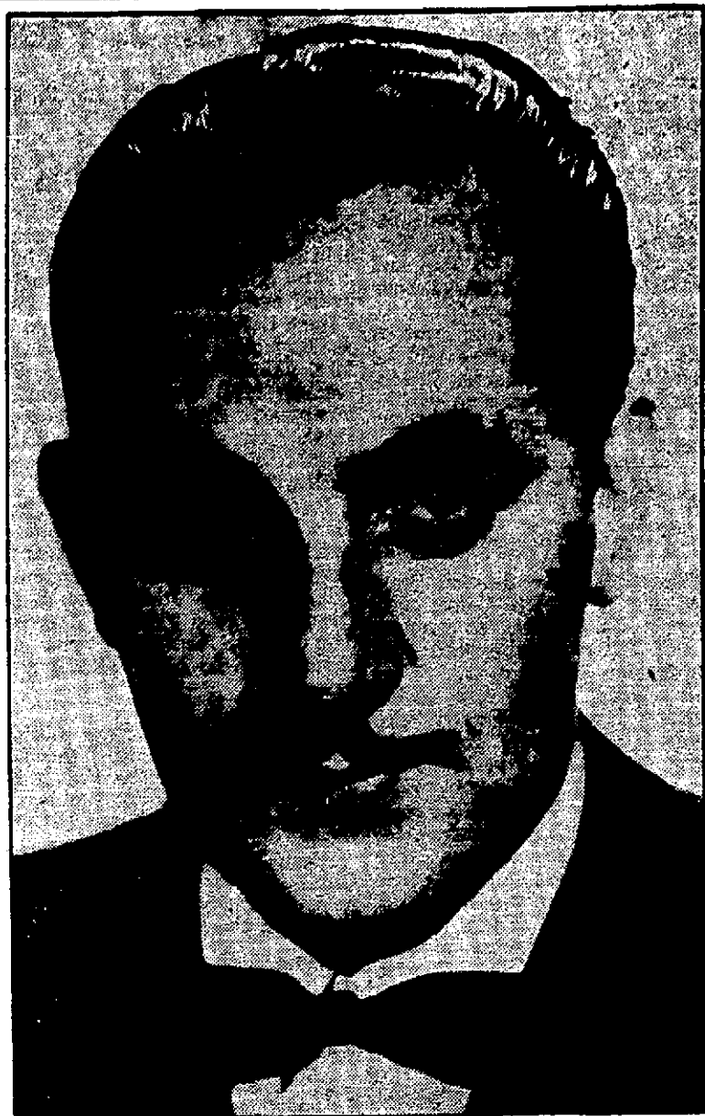
AT OHIO MONDAY—Shep Fields, above, and his orchestra with its "new music" will be at the Ohio theatre Monday for an all-day personal appearance program.

The Allen theatre has the Dead End Kids gracing its screen and the things that happen to them in "Block Busters" the picture now showing there, are terrific. The co-feature of this film is "Land Of The Outlaws."