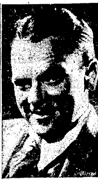
JAMES CAGNEY WBBM at 8

7:30 p. m. — Concert Hour (WIBA): with Gladys Swarthout; medley from "My Naughty Marietta"; "None But the Lonely Heart," "Southern Roses," "Love's Old Sweet Song." 8 p. m. — Great Artists (WIBA): Ezio Pinza; "Che Fiero Costume," "L'addio," "Costi," "La Danzeuse" from "Silhouettes"; Arensky, "Uncle Remus" Meditation.