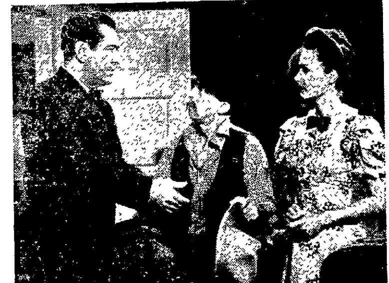
"SUSPENSE"—A decision is reached by Johnny Mack Brown in this tense scene with Raymond Hatton and Lynne Carver in the gripping drama, "Flame of the West." The lavish outdoor hit opens Wednesday at the Lyric theatre.