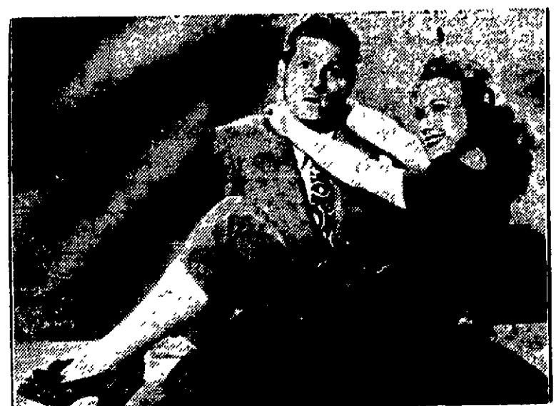
WHEN LASSIE MEETS LADDIE—The frenzied Danny Kaye scores another hit in "Wonder Man," with lovely Virginia Mayo as one lady in his life. The hilarious comedy of errors is a lavish technical film, replete with such touches as elaborate ballets, beautiful girls, and an array of gay tunes, and is currently showing at the Quilna theatre.

Comedy holds the whip-hand over the theatres this Sunday for wall-bulging, side-splitting pictures have been billed at each show house. Intermingled with a slight bit of drama, every thing adds up to a sweet dish of fun. How a ruthless, cold-blooded screen killer like Alan Ladd could get mixed up in anything as hilarious as "Duffy's Tavern," star-studded film now showing at the Ohio theatre, is something only an adroit script writer could determine. Is he out to get laughs or loot in the screen version of the popular radio program that features the antics of Ed "Archie" Gardner and his madcap cronies? This you will learn when you see the film which features more than 30 stars.