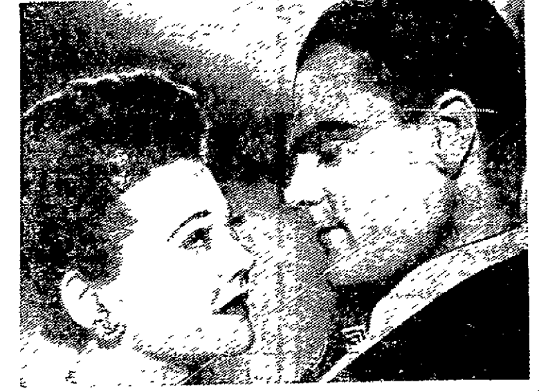
"CURRENT STARS"—James Cagney as a hard-hitting reporter and Sylvia Sydney as a seductive Oriental beauty, match wits in the exciting, "Blood in the Sun," opening at the State Theatre Sunday.