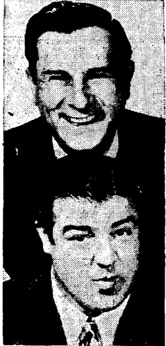
ABBOTT AND COSTELLO WIBA AT 9 P. M.

8 p. m.—Andre Kostelanetz (WBBM): with Lily Pons as guest; "It's a Grand Night for Singing," "Strange Music," "Polka" from "Sylvia" ballet, "Chere Nuit," "Blue Danube." 8:15 p. m.—Hall (WIBA): Frank Morgan, m. c.; John Scott Trotter's orchestra; Charioteers; guests, Lina Romay, vocalist, and Carmen Cavallaro, pianist. 8:30 p. m.—Starlight Serenade (WGN): "I'll Be Yours," "La Rueda," "There I've Said It Again," "Eres Tu," "Starlight Serenade," "Granada." 9:30 p. m.—Romance, Rhythm and Ripley (WBBM): "Gotta Be This Or That," "Orchids in the Moonlight," "Dark Eyes," "If You Were the Only Girl in the World." 10:15 p. m.—Jack Smith Show