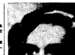
DIANA LYNN WBBM at 8

Drama 7 p. m. — Cavalcade of America (WIBA) Robert Young in "The Battle to Stay Alive."