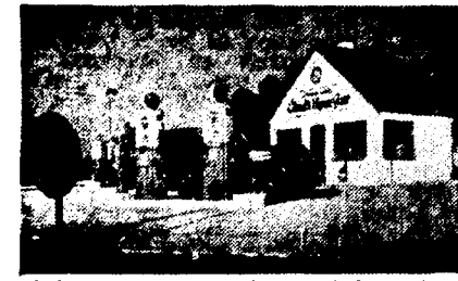
Only at these orange and white Clark's Stations can you buy this amazing new, improved Post-

Founded in Wisconsin, independently owned and operated, Clark's Super Gas Company features only one grade of this finest quality gasoline.