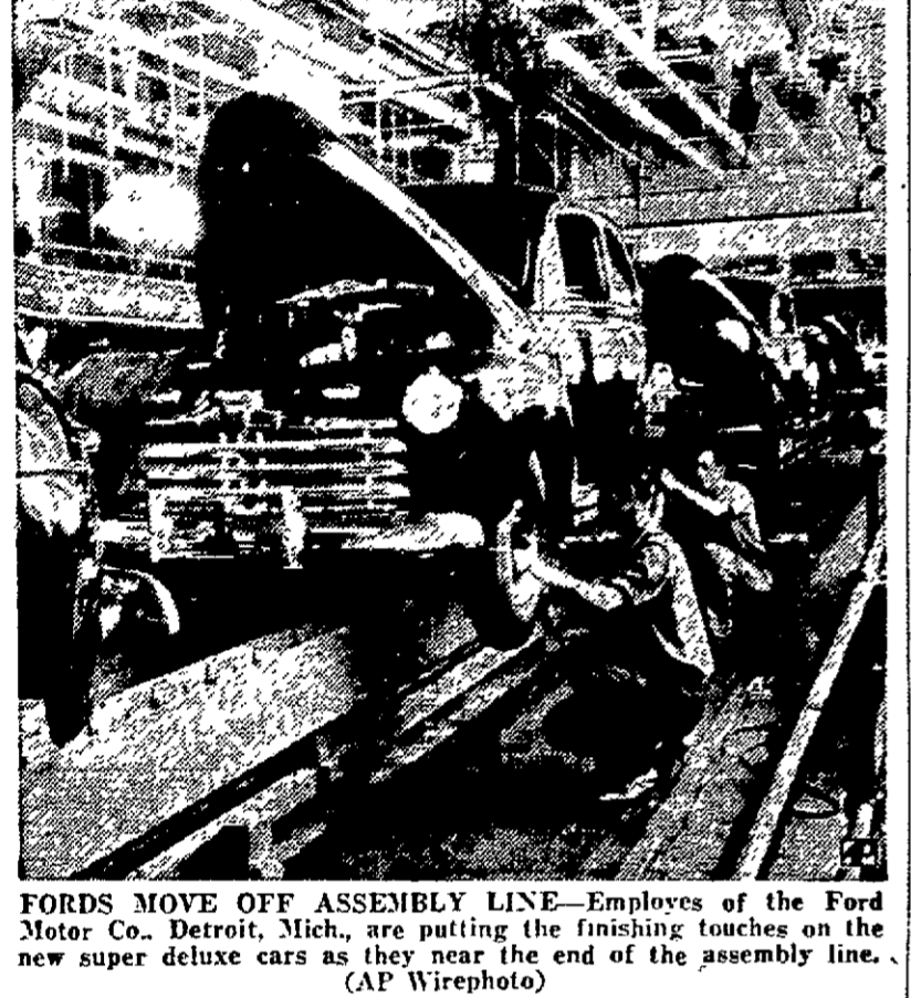
FORDS MOVE OFF ASSEMBLY LINE —Employees of the Ford Motor Co., Detroit, Mich., are putting the finishing touches on the new super deluxe cars as they near the end of the assembly line.