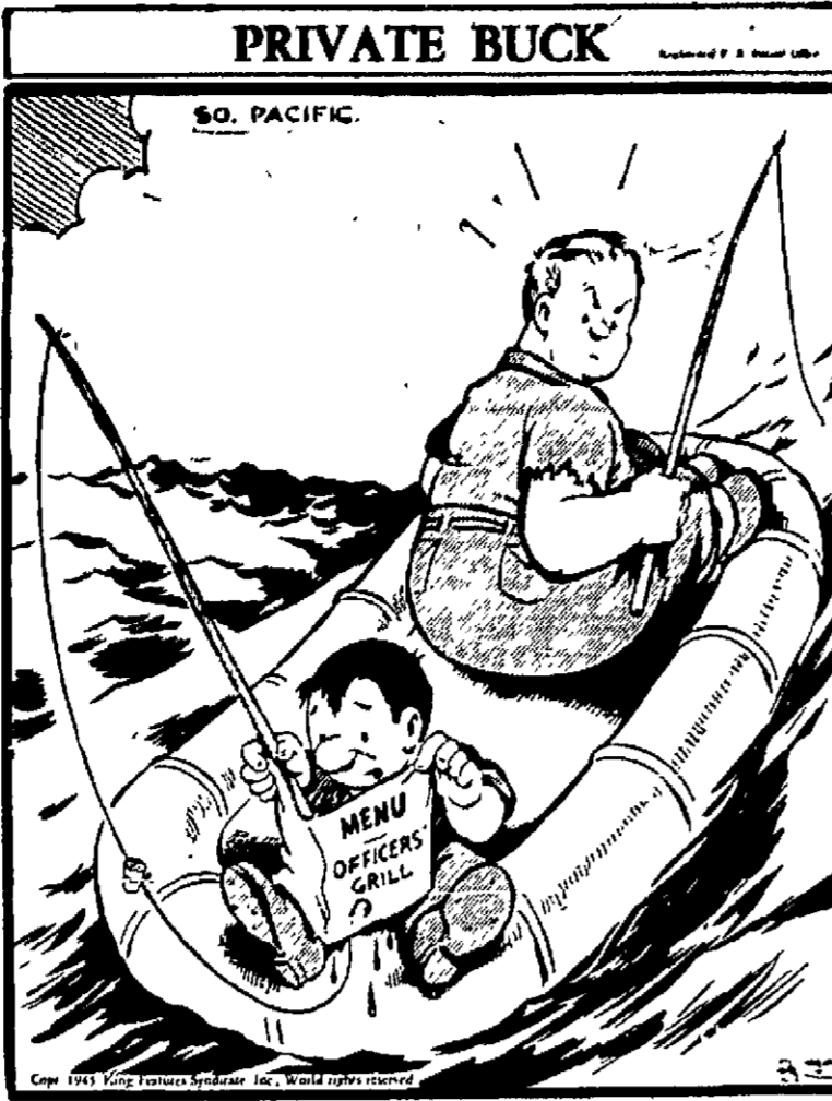
"It says 'choice of sea food - lobster thermidor, baked - had a la somethin' or other'"