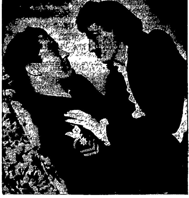
"NEW HIT"—Dennis Morgan and Barbara Stanwyck in a romantic moment from the new comedy hit, "Christmas in Connecticut," Friday at the Ohio theatre. The film, a hilarious comedy of errors, also stars Sydney Greenstreet and features S. Z. Sakall and Reginald Gardiner in supporting roles.