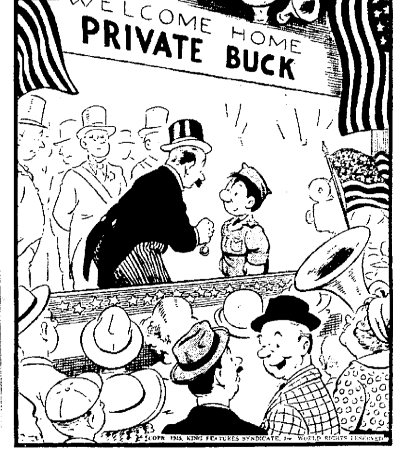
"They were going to give him the key to the city, but he picked the guardhouse lock so often they decided he didn't need one!"