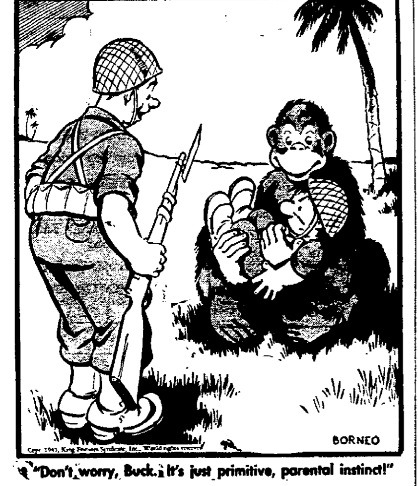
"Don't worry, Buck. It's just primitive, parental instinct!"