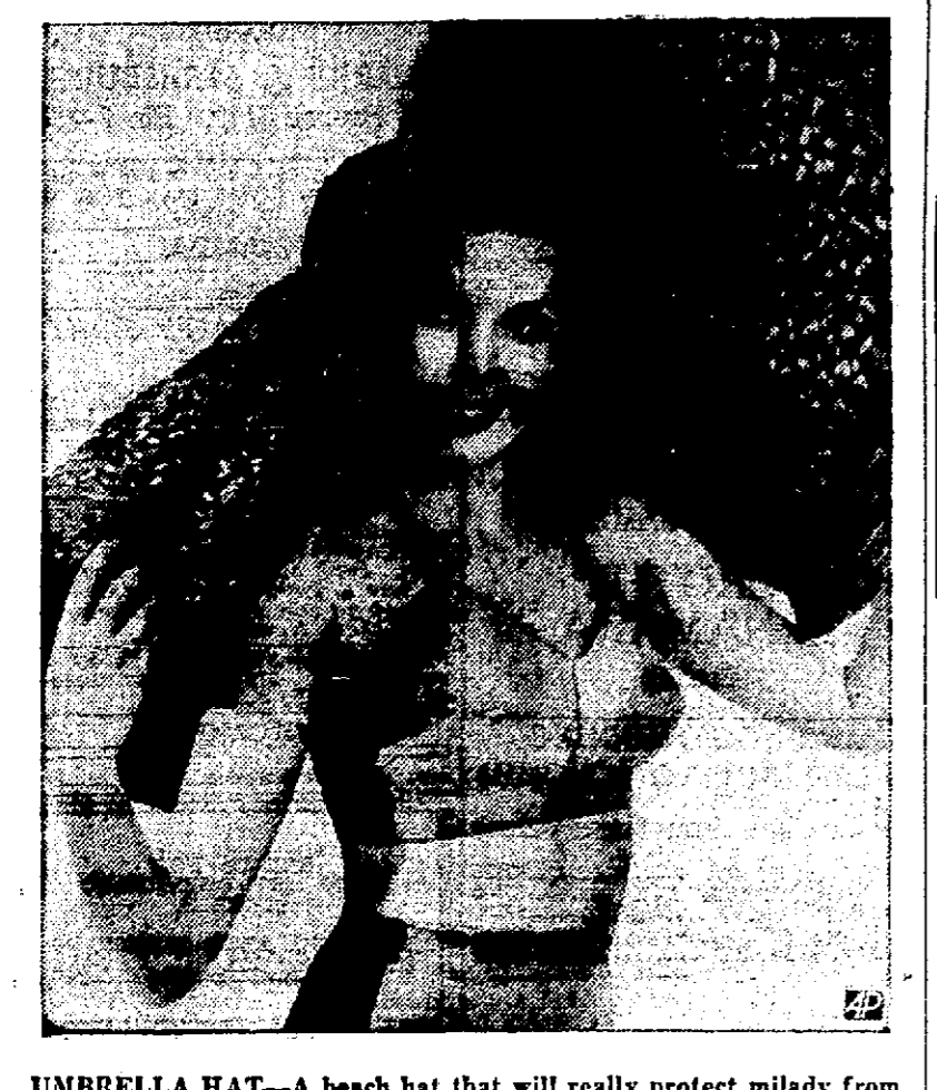
UMBRELLA HAT—A beach hat that will really protect milady from the sun is modeled by Ann Miller of the movies.