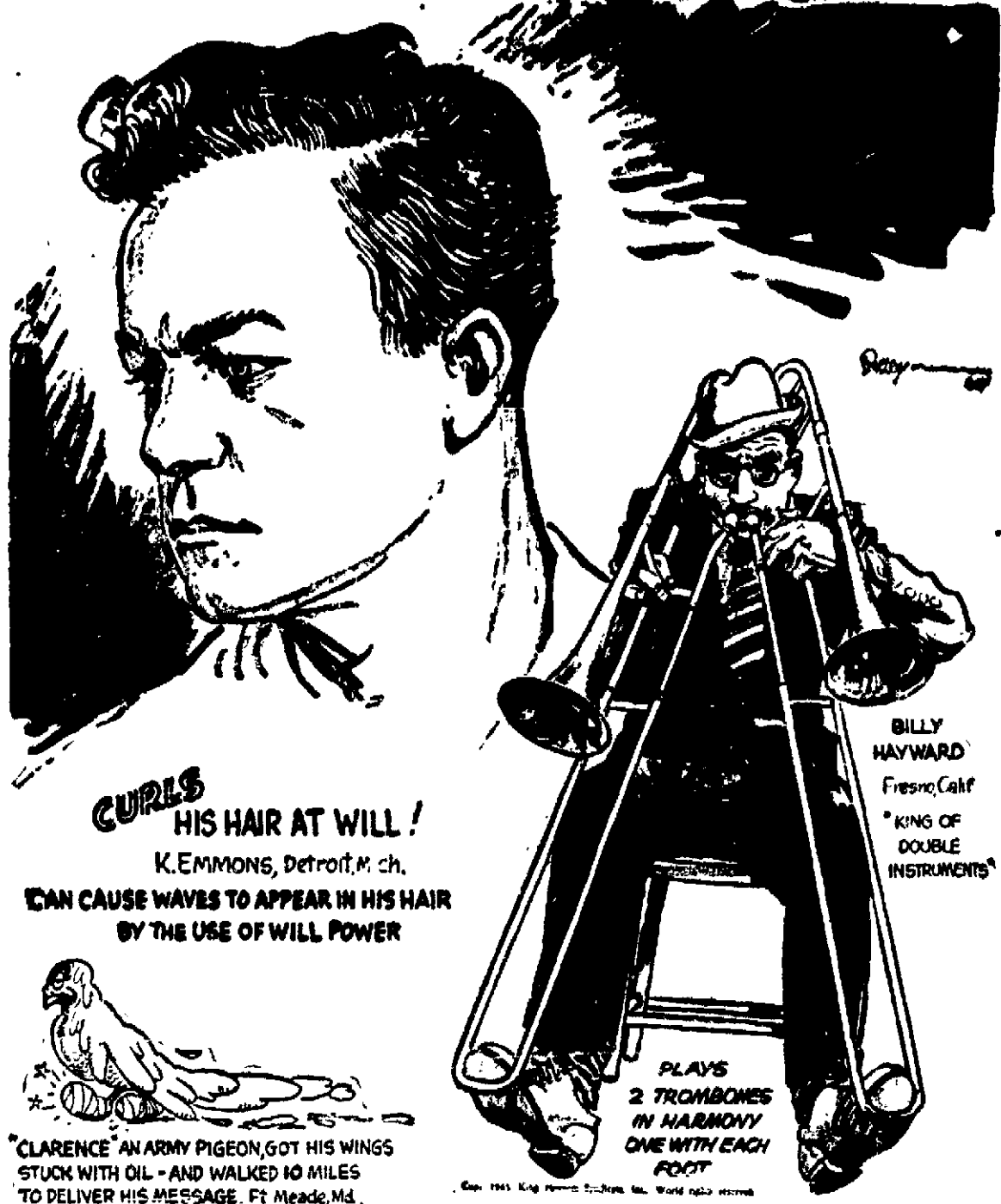
"CLARENCE" AN ARMY PIGEON GOT HIS WINGS STUCK WITH OIL - AND WALKED 10 MILES TO DELIVER HIS MESSAGE. Ft. Meade, Md.