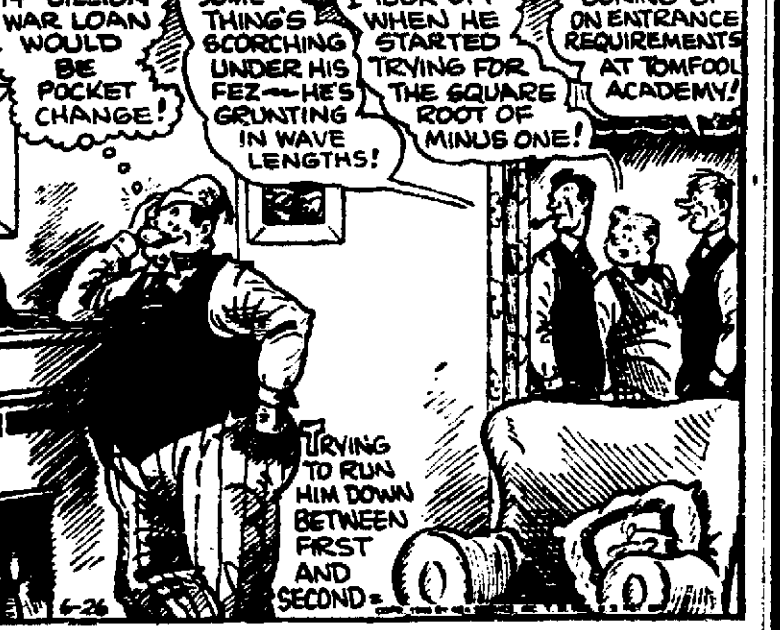
BORN THIRTY YEARS TOO SOON