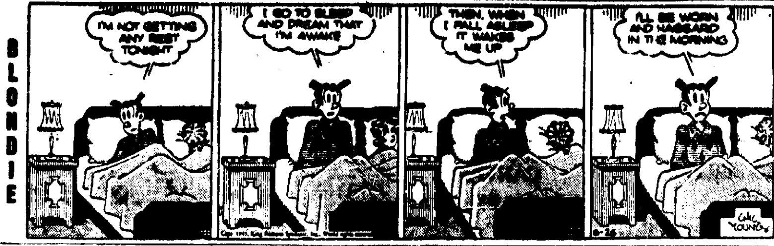
I'M NOT GETTING ANY BETT TONIGHT I GO TO SLEEP AND DREAM THAT I'M AWAKE THEN WHEN I FALL ASLEEP IT WAKES ME UP ALL BE WORND AND HABBARD IN THE MORNINGS

For Real Recreation DANCE and enjoy the fine liquors at the HOTEL WALDO Rathskeller