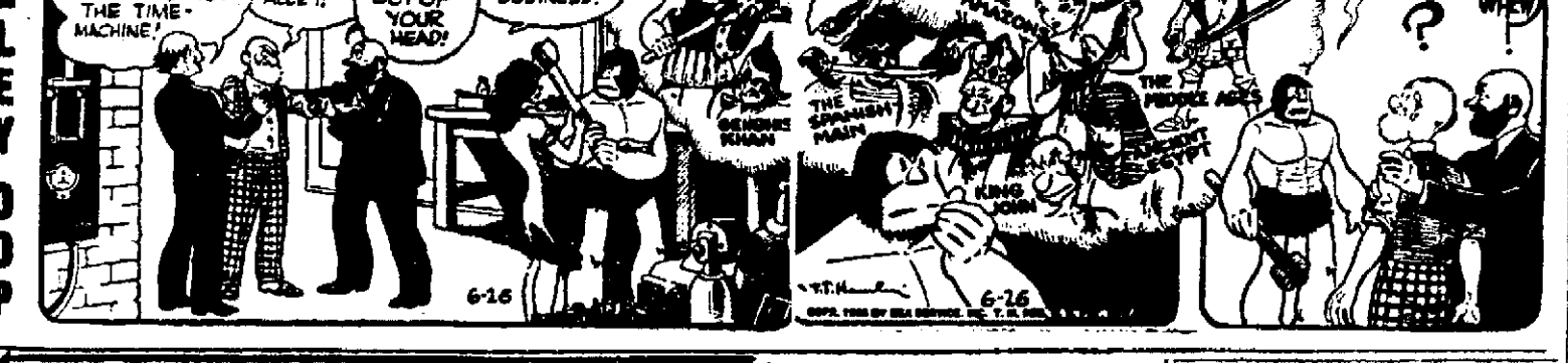
FOR HEAVENS SAKE, ELBERT, DON'T DESTROY THE TIME-MACHINE! I KNOW WHAT I'M DOING! YOU START CHANGING ALLEY! YOU CAN'T BE OUT OF YOUR HEAD! THINK A MOMENT, ALLEY... THIS IS PRETTY SERIOUS BUSINESS! PREHISTORIC MOO! BY GOLLY, DOC... I JUST CAN'T DO IT!