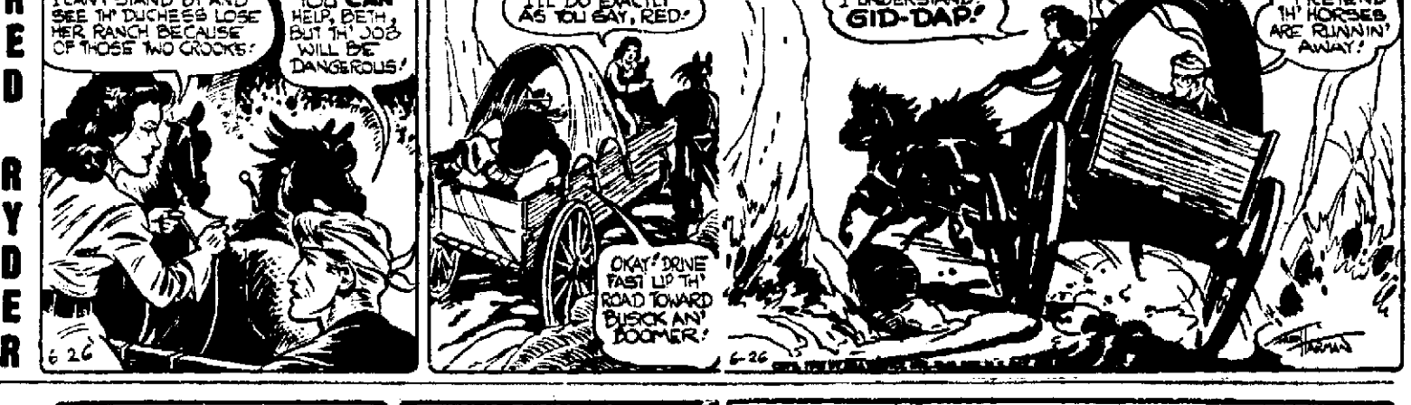
I CAN'T STAND BY AND SEE M'DUCHESSE LOSE HER RANCH BECAUSE OF THOSE TWO CROOKS! YOU CAN HELP, BETH, BUT TH' DOO WILL BE DANGEROUS! I'LL DO EXACTLY AS YOU SAY, RED! I UNDERSTAND, GID-DAP? PRETEND M' HORSES AGE 40 INSTEAD OF 20