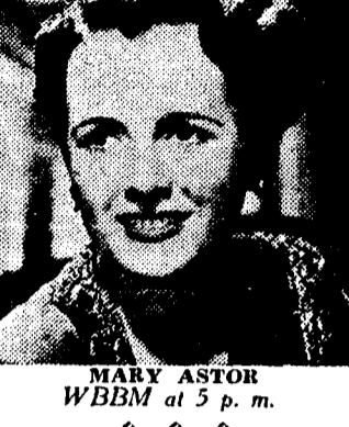
MARY ASTOR WBBM at 5 p. m.