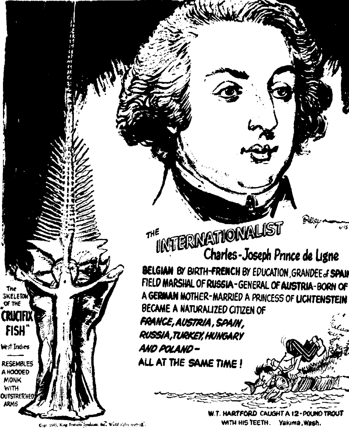
The SKELETON OF THE CRUCIFIX FISH RESEMBLES A HOODED MONK WITH OUTSTRETCHED ARMS

THE INTERNATIONALIST Charles-Joseph Prince de Ligne BELGIAN BY BIRTH-FRENCH BY EDUCATION, GRANDEE OF SPAIN FIELD MARSHAL OF RUSSIA-GENERAL OF AUSTRIA-BORN OF A GERMAN MOTHER-MARRIED A PRINCESS OF LICHTENSTEIN BECAME A NATURALIZED CITIZEN OF FRANCE, AUSTRIA, SPAIN, RUSSIA, TURKEY, HUNGARY AND POLAND- ALL AT THE SAME TIME!