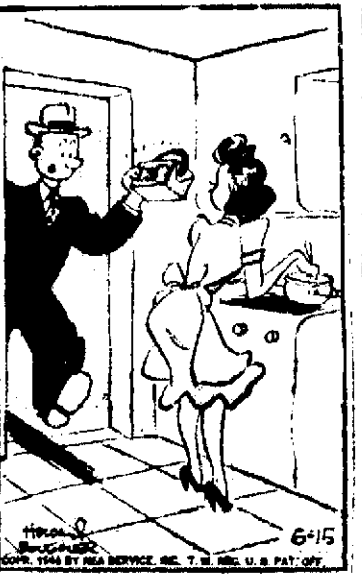
"I couldn't get any meat, so I bought animal crackers!"