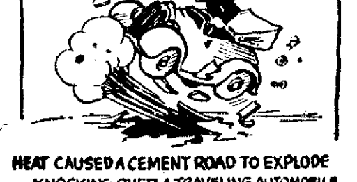
HEAT CAUSED A CEMENT ROAD TO EXPLODE KNOCKING OVER A TRAVELING AUTOMOBILE Detroit, Michigan