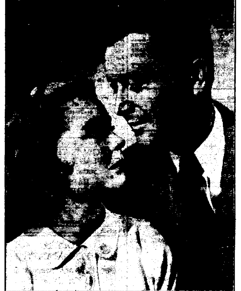
SYMPATHETIC LOVE STORY—As tenants in "The Enchanted Cottage," Dorothy McGuire and Robert Young, who co-star with Herbert Marshall, find their love is a magic thing capable of working a modern miracle. The inspiring romance is based on the play by Sir Arthur Wing Pinero, and opens Friday at the Ohio theatre.