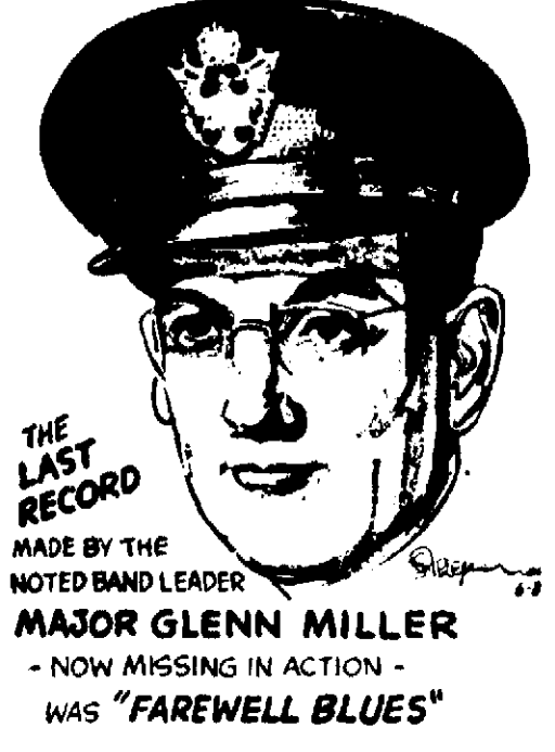
THE LAST RECORD MADE BY THE NOTED BAND LEADER MAJOR GLENN MILLER - NOW MISSING IN ACTION - WAS "FAREWELL BLUES"