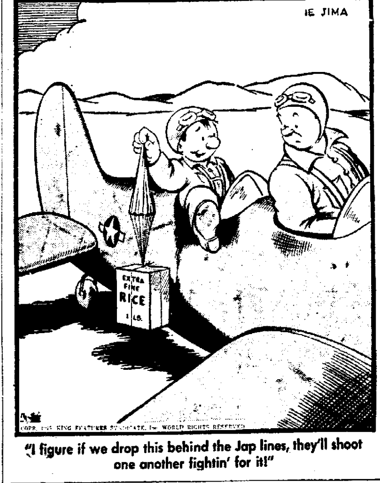
"I figure if we drop this behind the Jap lines, they'll shoot one another fightin' for it!"