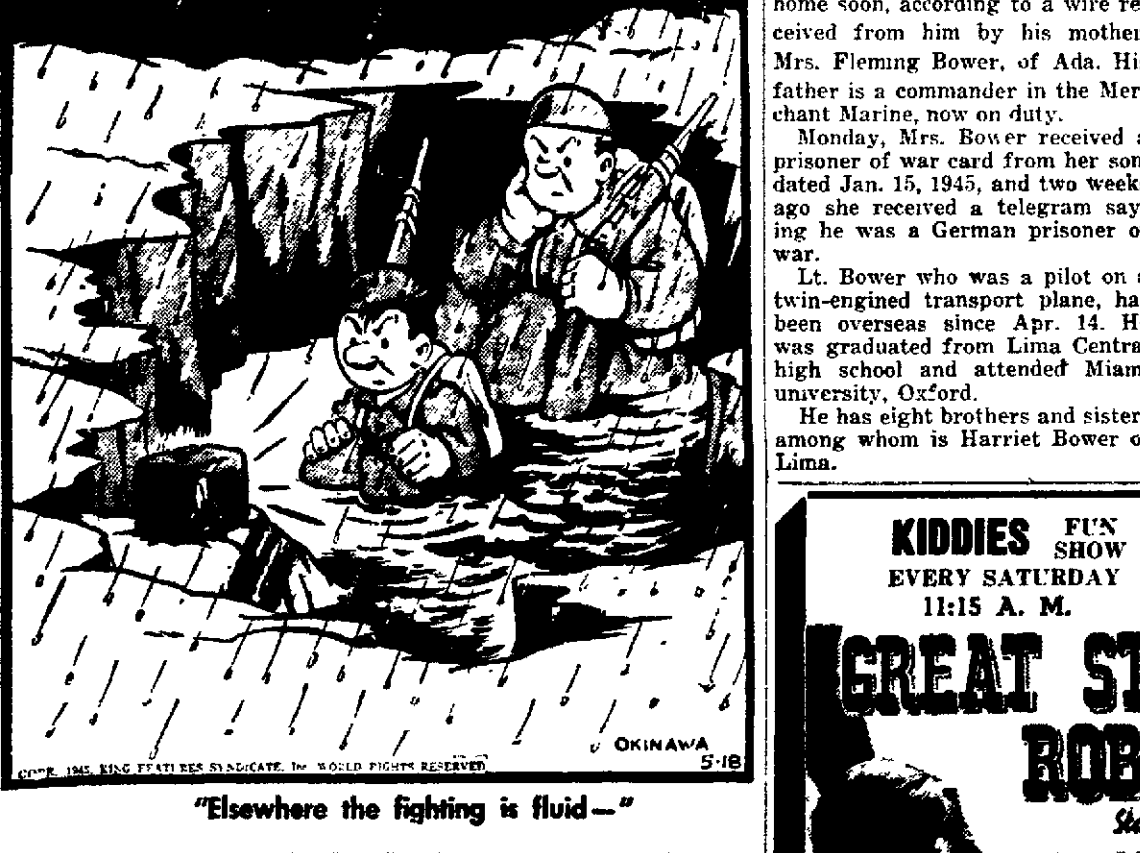
"Elsewhere the fighting is fluid..."