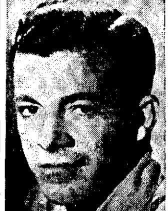
DANA ANDREWS WBBM at 7