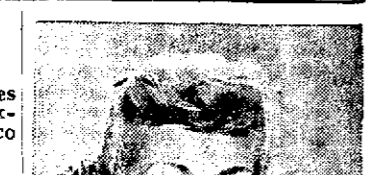
BETTY GRABLE WIBA at 6:30