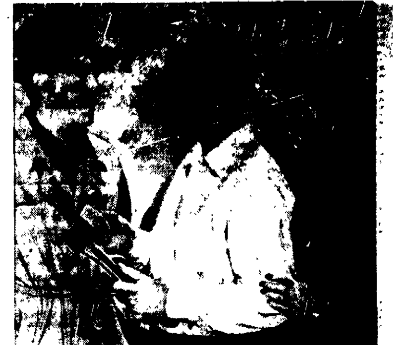
FIGHTING DRAMA—A tense moment in "Circumstantial Evidence," the new hit now showing at the Quilna theatre, as Michael O'Shea fights off the pleading of Lloyd Nolan and Trudy Marshall that he give himself up to the police for a murder he didn't commit. The action-packed story of a two-fisted guy, "Circumstantial Evidence" is filled with stirring drama, suspense and swift-moving action from start to finish.