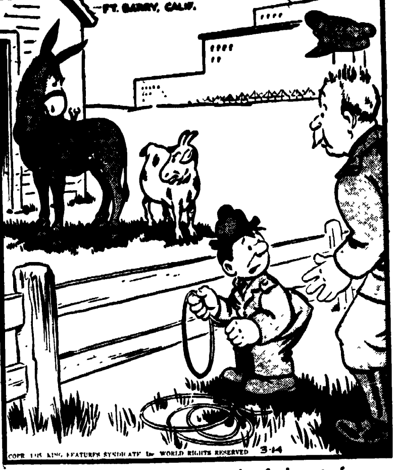
"It's a very delicate situation, Sir—that fool goat of ours swallowed a can of T.N.T.!"

MEATS, FATS—Red coupons Q-5 thru S-5 good thru March 31. Stamps E-5 thru X-5 good thru April 25. Stamps Y-5, Z-5 and A-2 thru I-2 good thru June 2. E-2 thru J-2 good thru June 30.