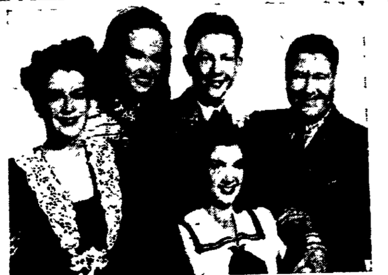
SCENE IN OHIO FILM—Rosemary DeCamp, Ann Blyth, Donald O'Connor, Peggy Ryan and Jack Oakie in "The Merry Monahans," story of show business, opening Tuesday at the Ohio theatre.