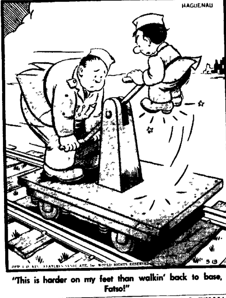
"This is harder on my feet than walkin' back to base, Fats!"