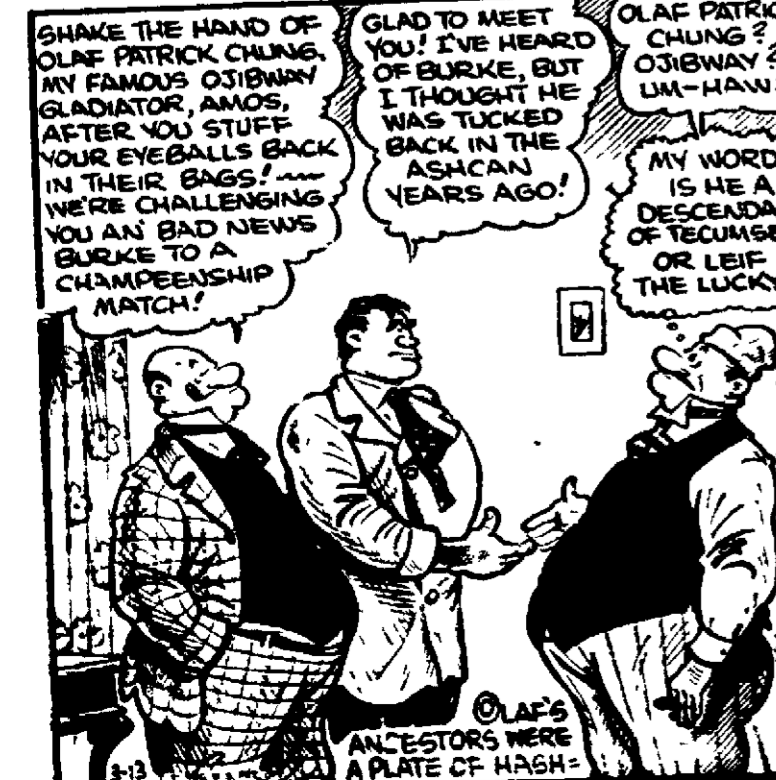
THE MENTAL MEDAL