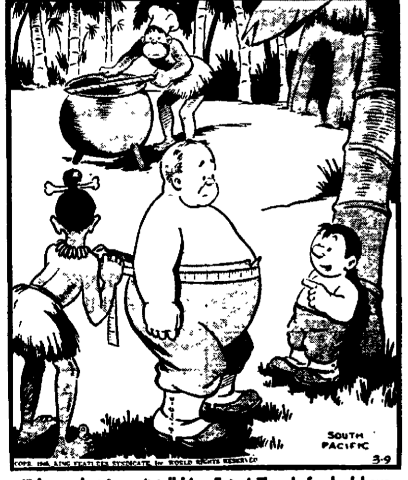
"I know, but I won't tell him, Fatso! The chef asked how many times the diameter equals the circumference!"