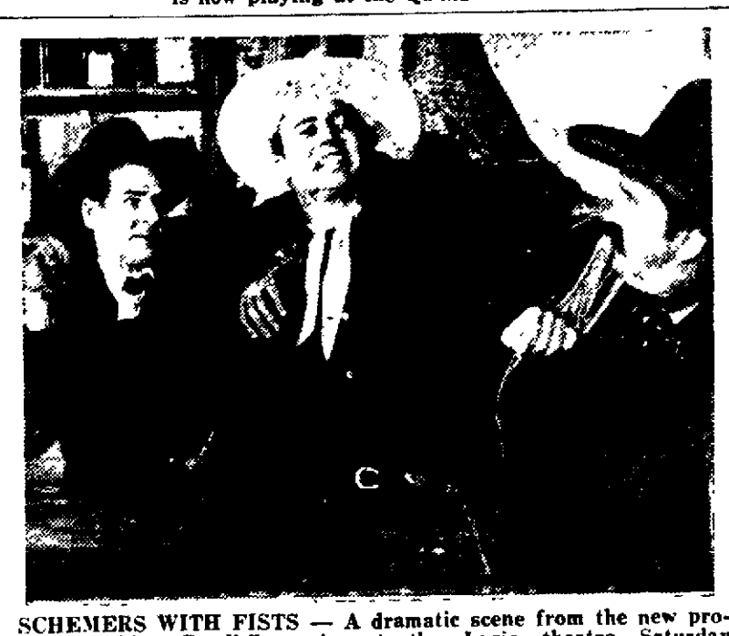
duction "Pinto Bandit" opening at the Lyric theatre Saturday midnight.