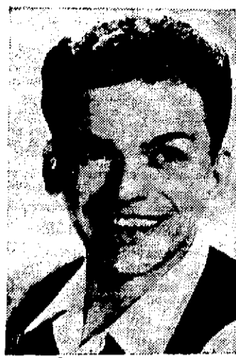
FRANK SINATRA WBBM at 7