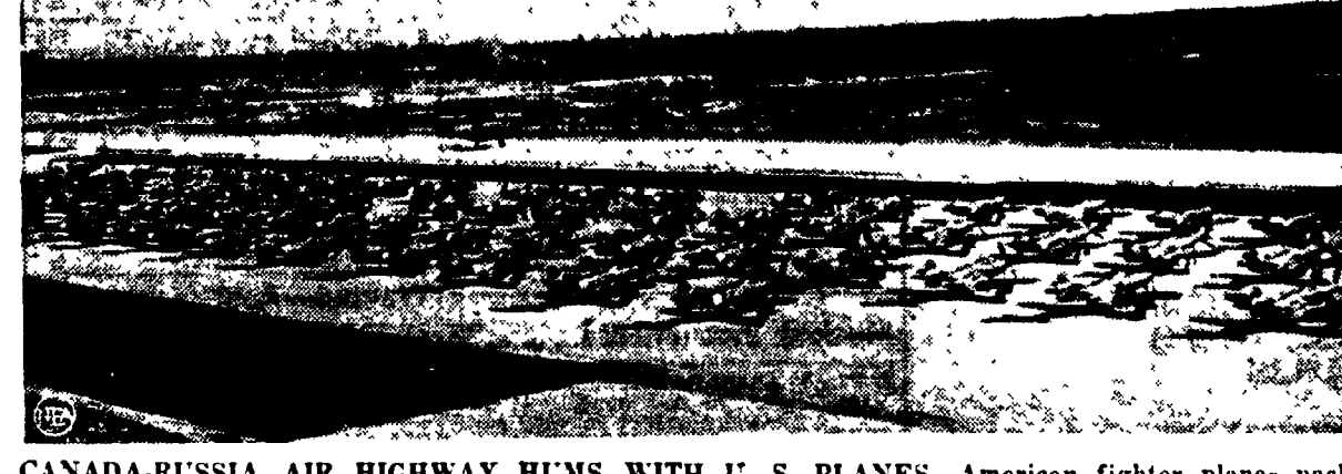
CANADA-RUSSIA AIR HIGHWAY HUMS WITH U. S. PLANES—American fighter planes pack the strip at Ladd Field, Fairbanks, Alaska, waiting to be ferried to Siberia, thence to the Russian fighting front by Red Army pilots. Inset map shows the Northwest Staging Route, a chain of airports from Edmonton, Alberta, to Fairbanks. Over this vital aerial highway more than 3000 U. S.-built planes have been ferried to Russia. The first ones passed thru in September, 1942, immediately saw action against the Germans at Stalingrad. Canada pioneered and built the route and the U. S. provided installations and extensions for which the Dominion will pay this country more than $39,000,000.