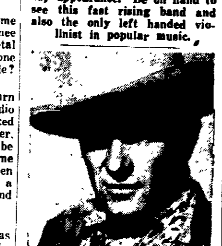
HERO PURSUED—Handy with his fists and sparse with his words is Rockin, played by John Wayne in "Tall in the Saddle," opening Sunday at the State theatre. Despite his aversion to women, the hero finds himself pursued by a temperamental ranch owner (Ella Raines) and by a lovely Easterner (Audrey Long).

Sorghum can be any number of varieties of a small-grained cereal grown largely in warm countries.