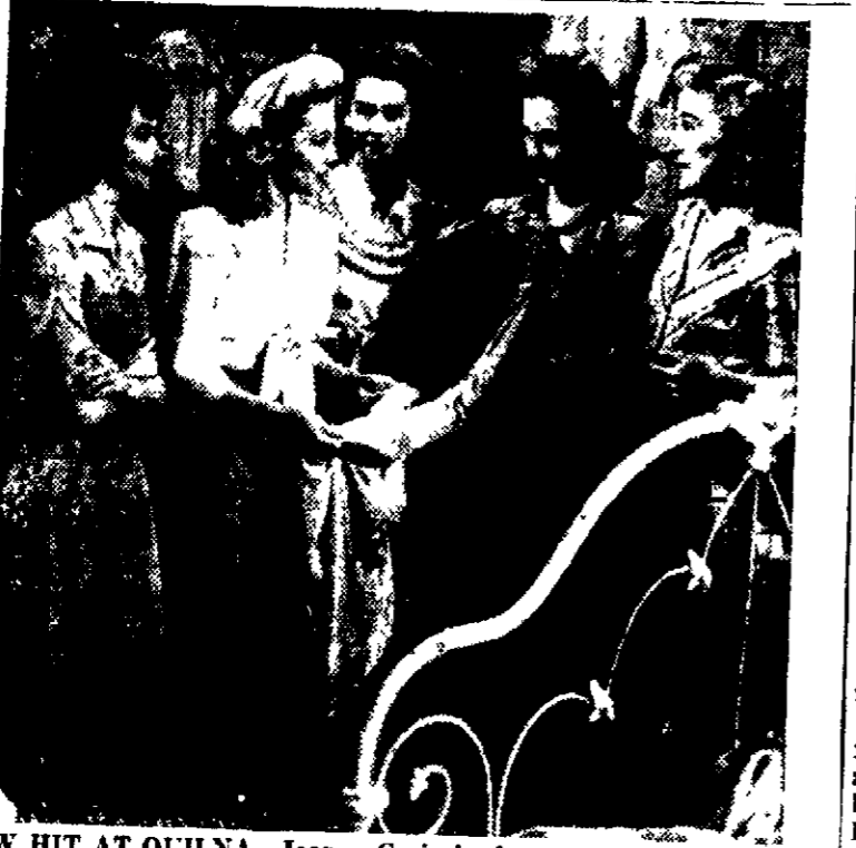
NEW HIT AT QUILNA—Jeanne Crain is the center of attraction as she displays her gown to an envious group of army wives on the eve of a formal dance at the Officers' Club in the Quilna theatre. "In the Meantime Darling," which is now playing at the Quilna theatre. The story of furlough love stars Jeanne Crain with Frank Latimore, Eugene Pallette, Mary Nash, Stanley Prager and Gale Robbins in featured roles.